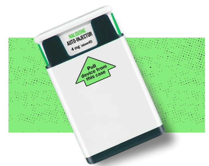
Auto-injector - Prefilled devices that inject medication into the outer thigh. ( These devices deliver verbal instructions when activated. )

If you give someone naloxone, stay with them until emergency help arrives or for at least four hours to make sure their breathing returns to normal.<sup>3</sup> Good Samaritan laws are in place in most states to protect those who are overdosing and anyone assisting them in an emergency from arrest, charges, or a combination of these. Learn about the laws in your state.