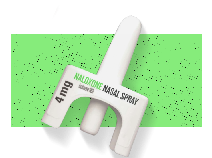
Nasal spray - Prefilled devices that spray medication into the nose.

Naloxone is easy to use and light to carry. There are two forms of naloxone that anyone can use without medical training or authorization: